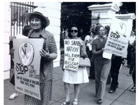
Bella Abzug, one of the founders for Women Strike for Peace, protesting during the 1961 strike to end the use of nuclear weapons

June 10, 1963- The Equal Pay Act of 1963 became law. It guaranteed that men and women doing similar work in a similar establishment received the same wages.