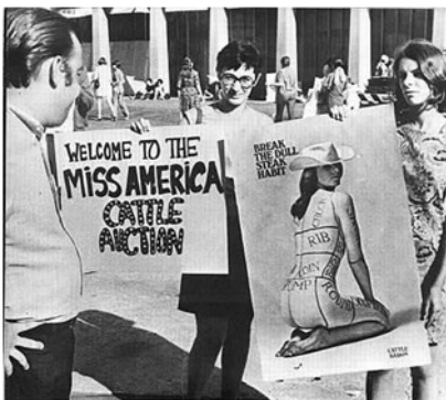
Women protested the degradation of women in Miss America Pageant in 1968.

June 23, 1972- Title IX bans sex discrimination in schools. No one could be denied access to any activity or education that was given federal assistance. This greatly increased the number of women in athletics and post-secondary education.