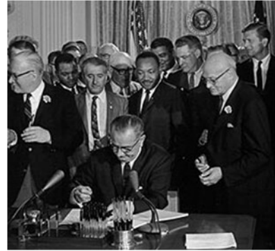
President Lyndon B. Johnson signing the Civil Rights Act of 1964.

March 22, 1972- The Equal Rights Amendment, which prohibited sex discrimination and equal rights for men and women, passed in the Senate and enforced in the States. This was a major success and a turning point for women in the movement.