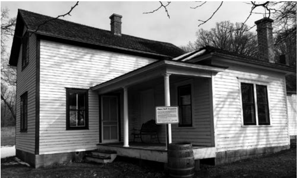
Ohman family house