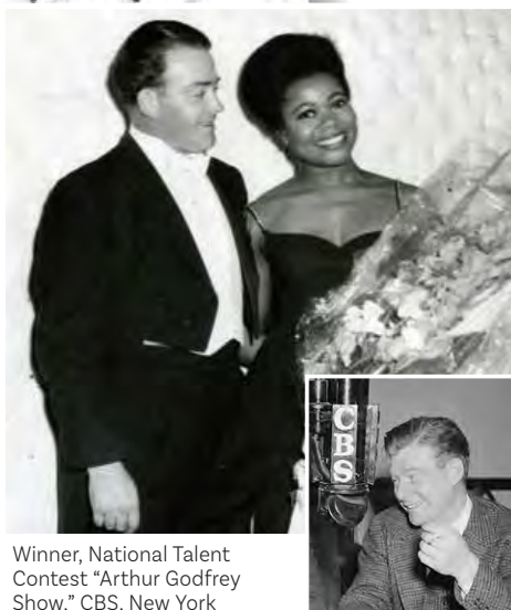
Winner, National Talent Contest “Arthur Godfrey Show,” CBS, New York

She made history as the first African-American female vocalist to be featured in a television commercial for Northwestern Bell Telephone company. Her life was marked