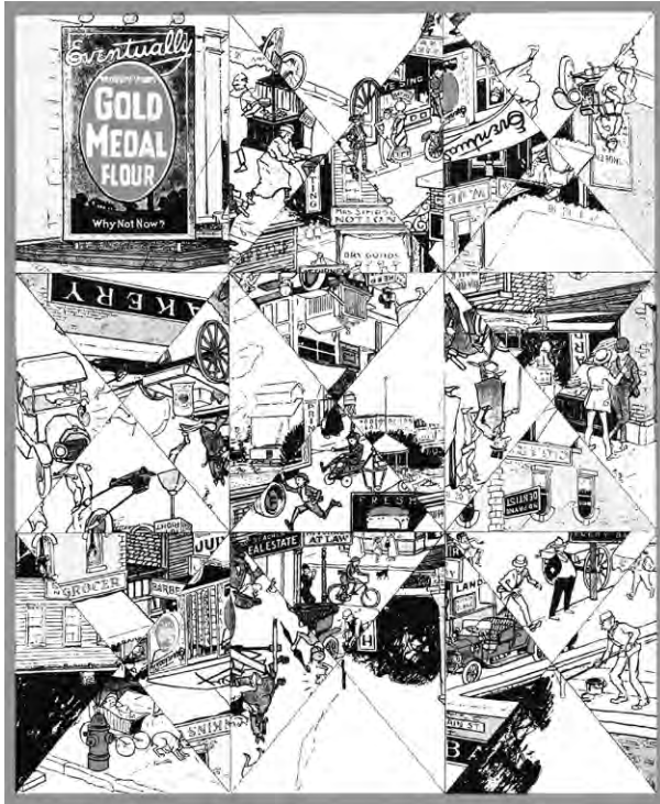
The Gold Medal Flour puzzle contest was shared in the Saturday Evening Post in 1921.