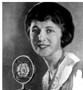
Betty Crocker School of the Air becomes one of the longest shows in radio history.

Bisquick's "miracle mix" has evolved throughout the years, inspiring home cooks and bakers for decades.